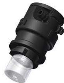
high bayonet plug III G51000

Drawings made available by bfs as to the layout or water pipes for battery filling systems are only examples, which require adaptation for each specific battery grouping. The person responsible for the installation of a battery filling system including the water pipes is also responsible to ensure that all instructions given by the producer of the batteries as well as all relevant instructions by the European Union are followed carefully. (see for instance EU instruction EN 50272 Para 10.2)