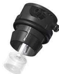
clip-in plug IV for 4 bayonet I4NV00