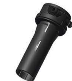
clip-in plug IV with float housing I4N420