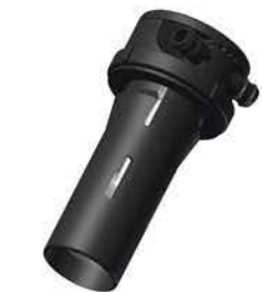
clip-in plug IV with float housing I4N330

Drawings made available by bfs as to the layout or water pipes for battery filling systems are only examples, which require adaptation for each specific battery grouping. The person responsible for the installation of a battery filling system including the water pipes is also responsible to ensure that all instructions given by the producer of the batteries as well as all relevant instructions by the European Union are followed carefully. (see for instance EU instruction EN 50272 Para 10.2)