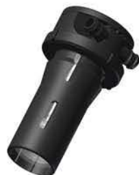
clip-in plug IV with float housing I4N260

Drawings made available by bfs as to the layout or water pipes for battery filling systems are only examples, which require adaptation for each specific battery grouping. The person responsible for the installation of a battery filling system including the water pipes is also responsible to ensure that all instructions given by the producer of the batteries as well as all relevant instructions by the European Union are followed carefully. (see for instance EU instruction EN 50272 Para 10.2)