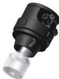
Clip-in plug III I51000

Drawings made available by bfs as to the layout or water pipes for battery filling systems are only examples, which require adaptation for each specific battery grouping. The person responsible for the installation of a battery filling system including the water pipes is also responsible to ensure that all instructions given by the producer of the batteries as well as all relevant instructions by the European Union are followed carefully. (see for instance EU instruction EN 50272 Para 10.2)