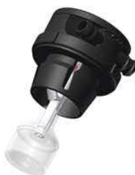
clip-in plug IV I4N100