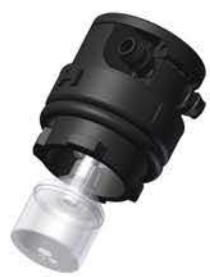
4 bayonet plug III H51000