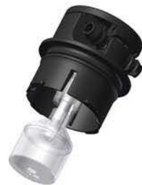
push-in plug III A51000